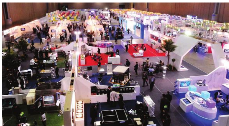
Services for fairs