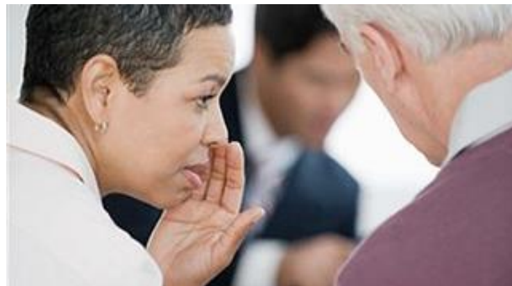
Interpreting and simultaneous translation equipment